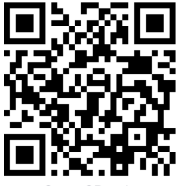
Or use QR code